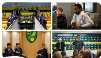
Premier League Communities and Norwich Cit...

Norwich City CSF · 30/05/2022 ... It was a pleasure to host you all! 🧡💚 @PakefieldSchool @TaverhamHigh @LynnGroveAc