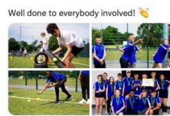
Premier League Communities

The students enjoyed multi-skills challenges focussed on togetherness and teamwork! 🧡