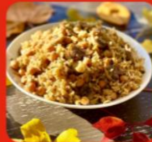
MIDDLE EASTERN PILAF