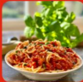
ITALIAN PASTA SAUCE